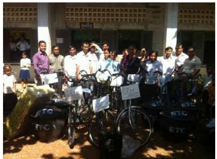
Cambodia: Our contact with students