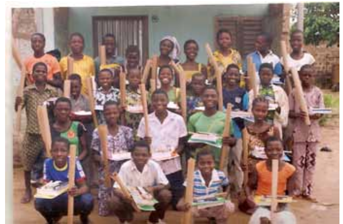
Benin: Students with their scholarships.